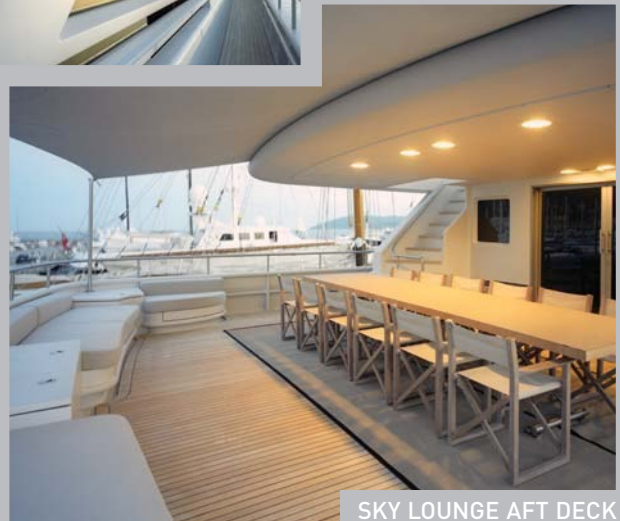
SKY LOUNGE AFT DECK